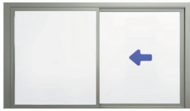
OX (O=Fixed glass, X=Sliding glass)