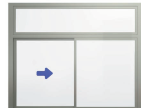
XO with overhead light